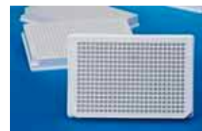
Disc-SPE 384 Well Plate