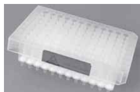
Disc-SPE 96 Well Plate